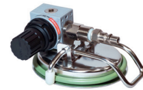
Filler cap with reduction valve Art.No. 11647101